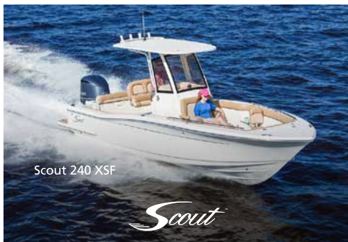
Scout 240 XSF