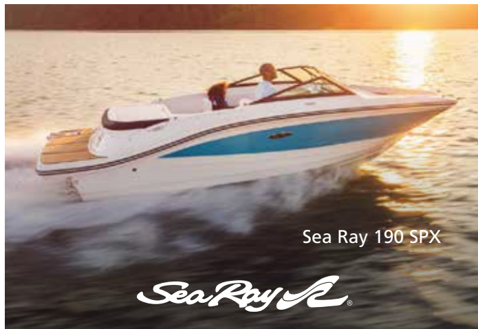
Sea Ray 190 SPX