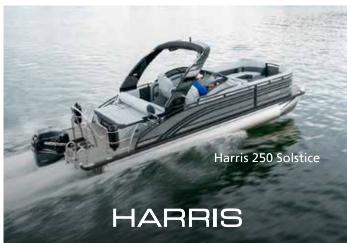
Harris 250 Solstice