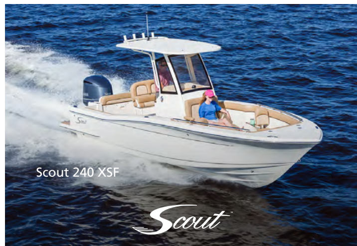
Scout 240 XSF