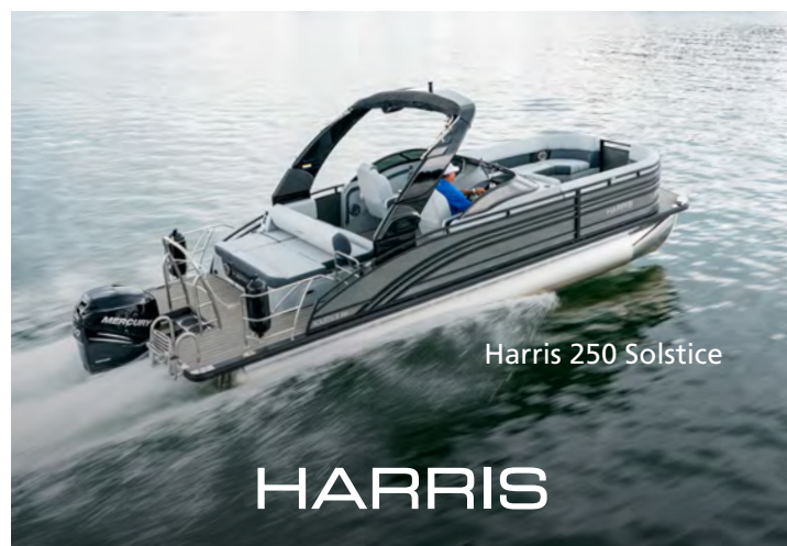
Harris 250 Solstice