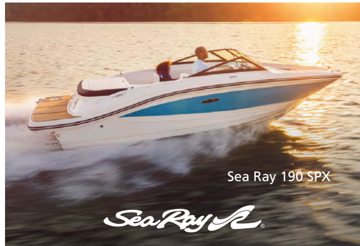
Sea Ray 190 SPX